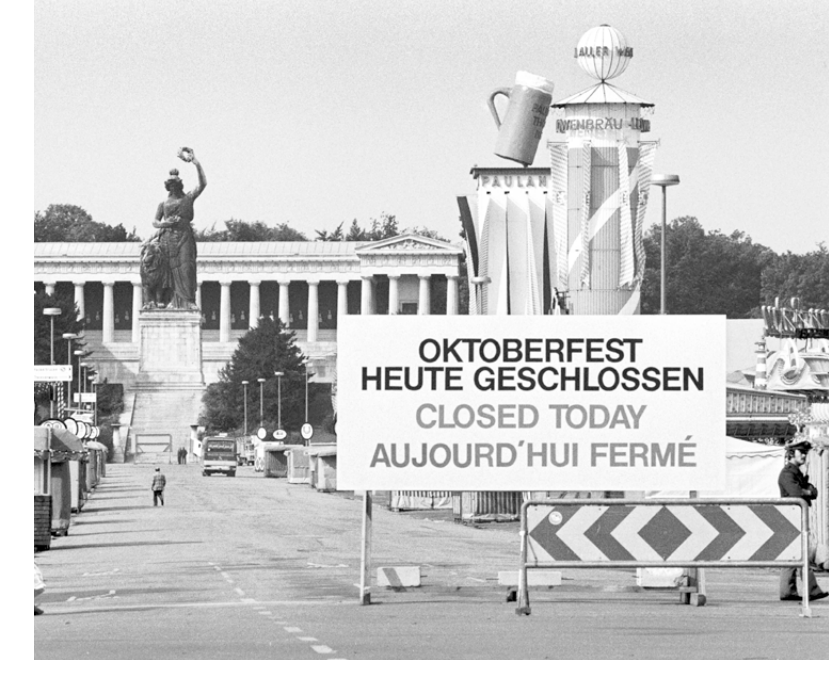
The Oktoberfest was suspended for one day on 30 September 1980