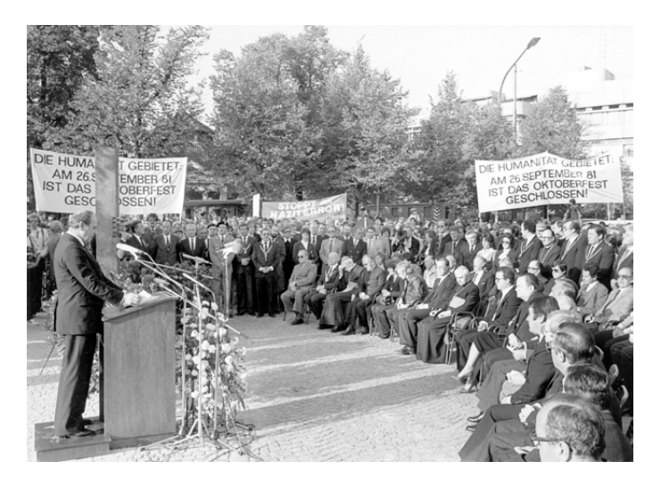
Memorial service at the scene of the bomb attack, 26 September 1981