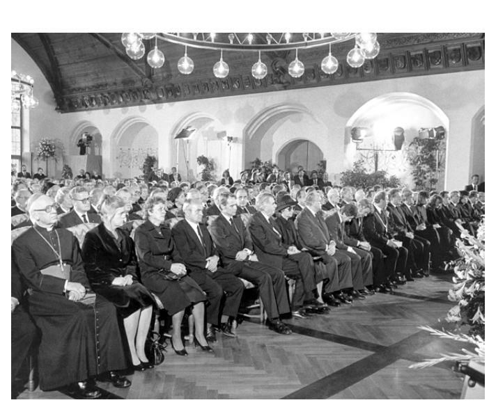
Memorial service at the scene of the bomb attack, 26 September 1981