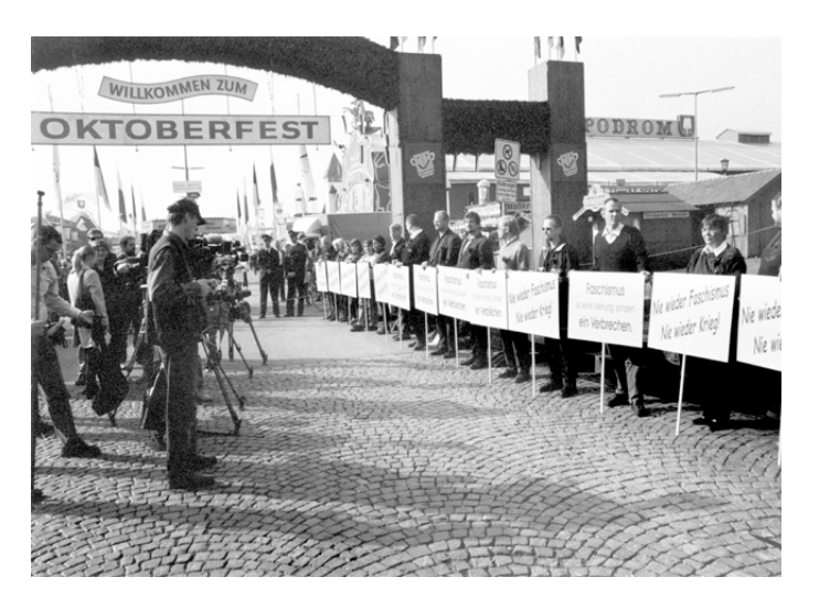
Anti-fascist vigil, 26 September 2000

'DGB-JUGEND München' (German Trade Union youth association) has organised a rally with a wreath-laying ceremony every year on the anniversary of the bombing to commemorate the victims and keep critical discourse on the attack alive.